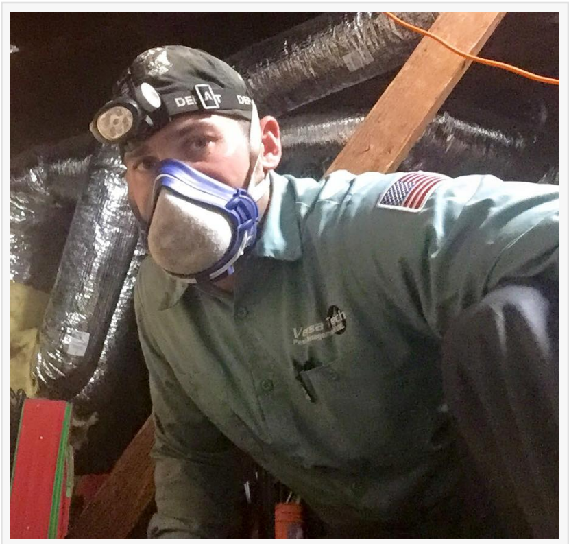
Greater Los Angeles Rodent Control Company Versa-Tech Pest Management