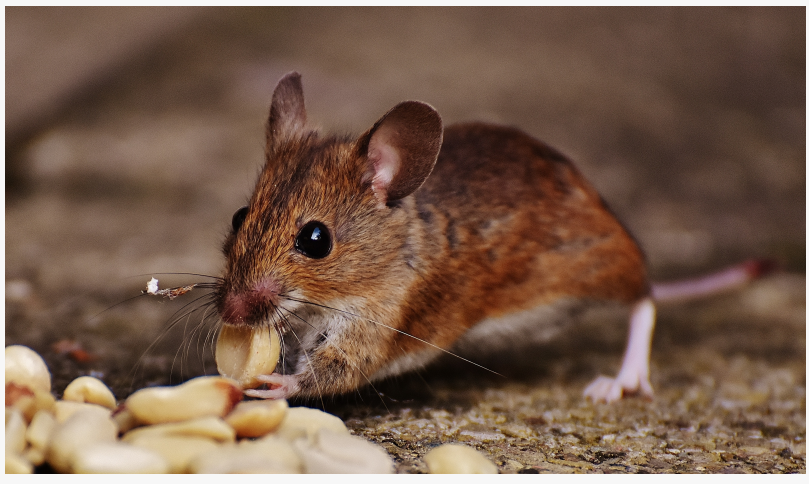
Rodent Control Greater Los Angeles Area

429-1213 or learn more about Versa-Tech's Rodent Control Services at <u>https://versatechpm.com/services/rodent-mice-rat-control/</u>