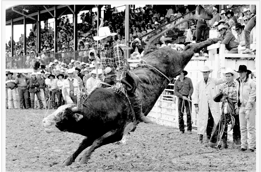
Lane Frost Last Ride

This press release can be viewed online at: https://www.einpresswire.com/article/531494405