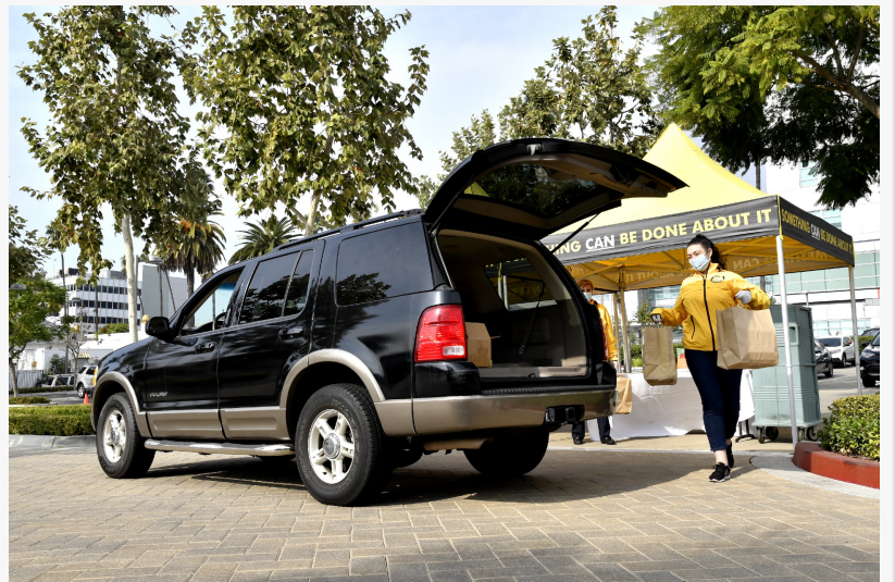
Volunteer Ministers moved turkey dinners from hotbox to car and rushed them to their destinations.