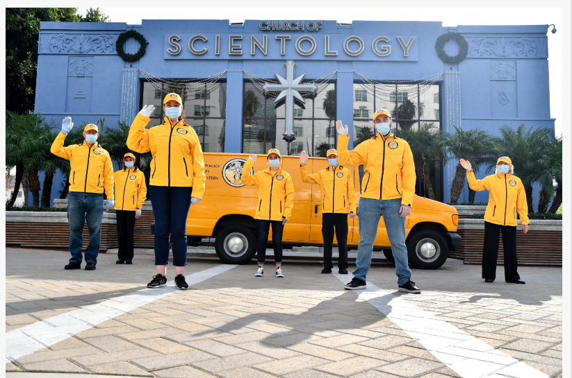
L.A. Volunteer Ministers gather at the Church of Scientology to bring special Thanksgiving gifts to essential workers.

Inside each bag was a message from the Church: “HAPPY THANKSGIVING from the Church of Scientology Los Angeles. Stay safe and stay well.” On the card was a QR code to the Church’s How to Stay Well Prevention Resource Center containing dozens of videos and three educational booklets: How to Keep Yourself & Others Well, How to Protect Yourself & Others with a Mask & Gloves and How to