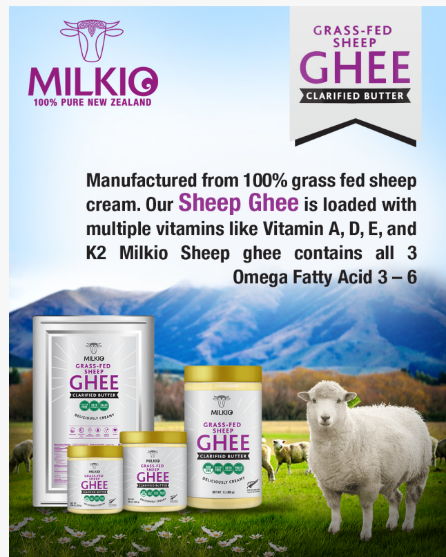
Grass fed sheep ghee

Presently, Milkio ghee products are available in: