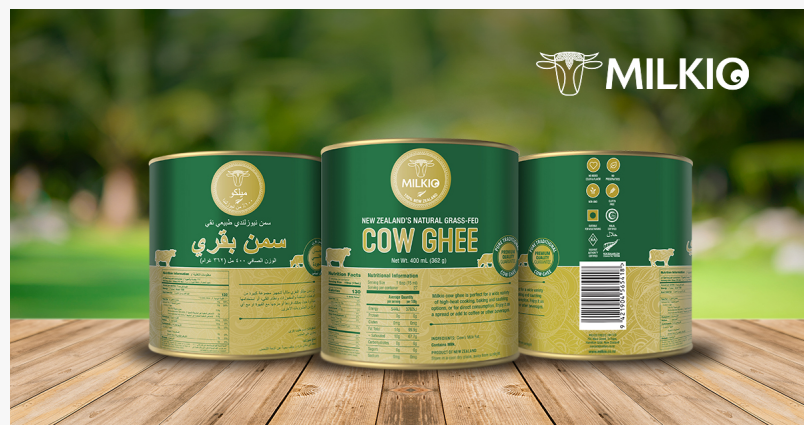
Grass fed conventional ghee