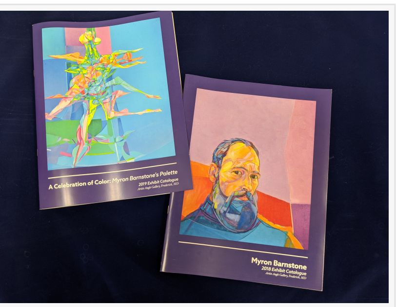
Barnstone Studios Exhibit Catalogues, now discounted

Free and Discounted Master Drawing Classes