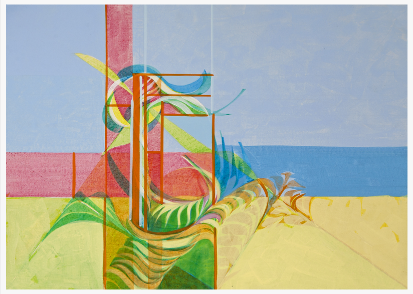
Seabird by Myron Barnstone, Devon, 1971, Acrylic on paper, 15.5" x 21.5"