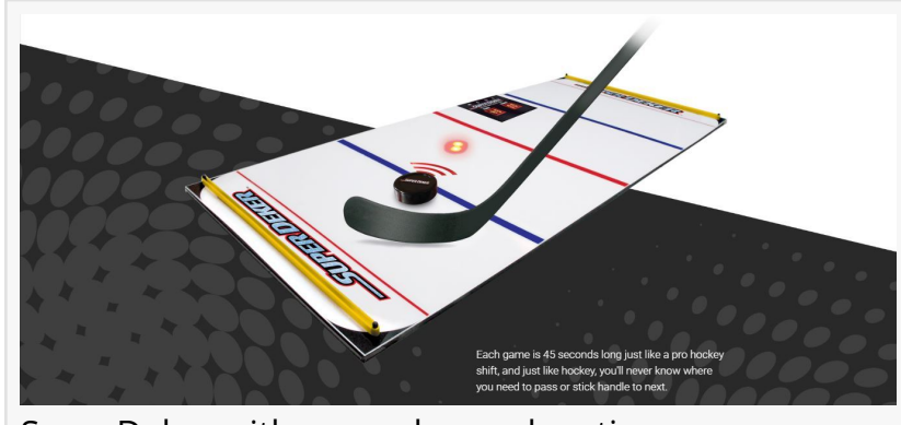
SuperDeker with gameplay explanation

"We are proud to announce that our SuperDeker product will be available on the shelves for the Arlington community, and we could not be more excited to add Sports Etc. to our list of retail partners. With the addition of Sports Etc. to our team, SuperDeker