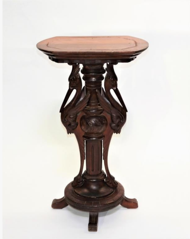
19th century walnut and cherrywood New York Victorian Aesthetic carved crane pedestal having an oval-shaped top over an ornate column with exquisitely carved cranes (est. $1,500-$2,500).

Leading the fine jewelry category will be an 18kt gold carved citrine pendant, made in the 20th century by David Webb (N.Y.), boasting a large carved citrine with an Asiatic inspired design inset with six diamonds encased in