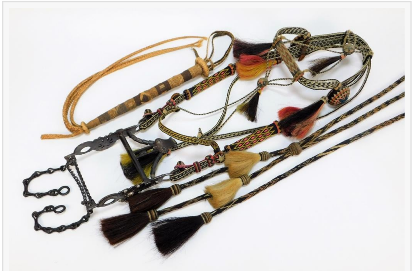
Extremely fine horse hair bridle group of the kind made in prison in the Southwestern U.S. in the 20th century, in exceptional condition (est. $2,000-$3,000).

EINPresswire.com/ -- Bruneau & Co. Auctioneers will bid farewell to autumn with an online-only Fall Antiques & Fine Art auction on Thursday, December 10th, starting at 6 pm Eastern time. The auction will feature nearly 400 lots of paintings, decorative arts, furniture, jewelry, silver, Asian arts, collectibles and more, pulled from prominent estates and collections across New England.