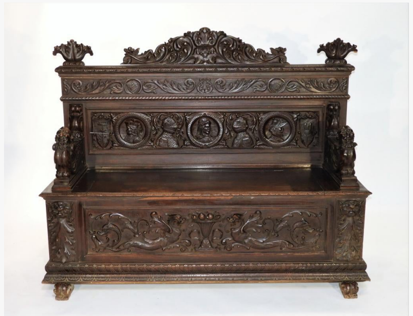
19th century European Gothic Revival figural hall bench featuring an ornately carved crest over acanthus leaf band over military official portrait cartouches (est. $1,500-$2,500).