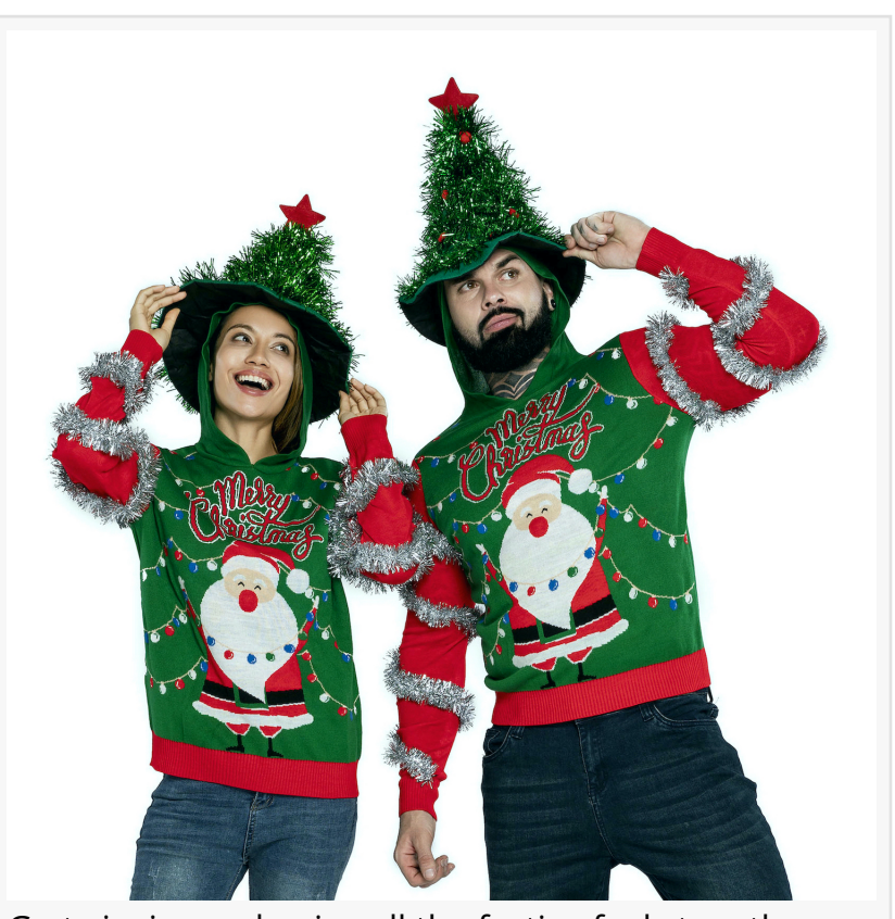
Go twinsies and enjoy all the festive feels together.

Decked with flashing LED lights, real tinsel, bows, pom poms and bauble