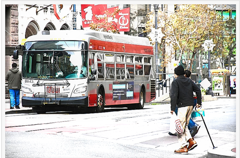
Akathisia Awareness Campaign Reaches California Commuters