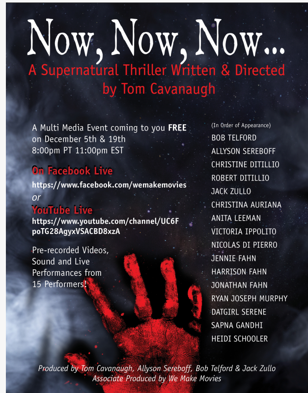
The Show Postcard!