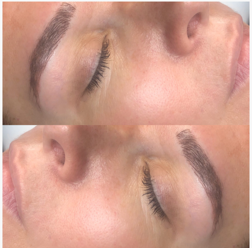
Bold Natural Looking Brows with Microblading