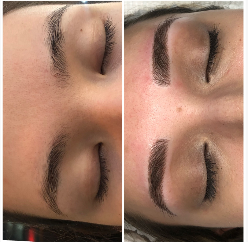
Before and After Microblading