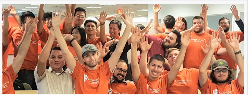
Bay Valley Tech Coders