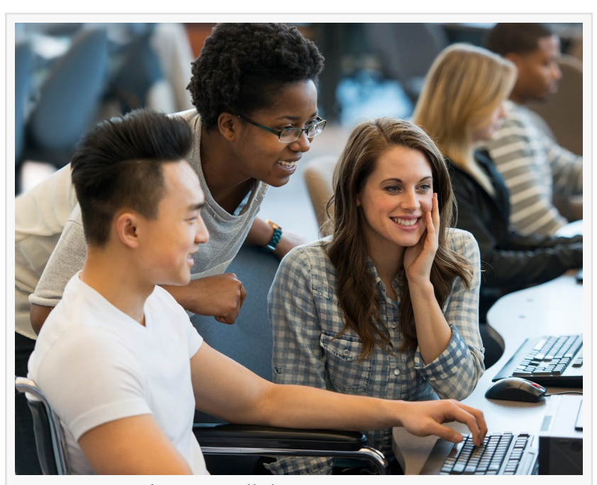
Learning Code in a Collaborative Environment

MODESTO, CALIFORNIA, UNITED STATES, December 3, 2020 /EINPresswire.com/ -- Software continues to transform numerous tech and non-tech sectors at a rapid pace. Healthcare, finance, transportation, food processing and agricultural companies are all leveraging advanced software and analytics to drive profit growth, creating unparalleled opportunities for skilled programmers. Unfortunately, many code academies, which can help people quickly transition into tech jobs, cost $15,000 or more. Bay Valley Tech's unique