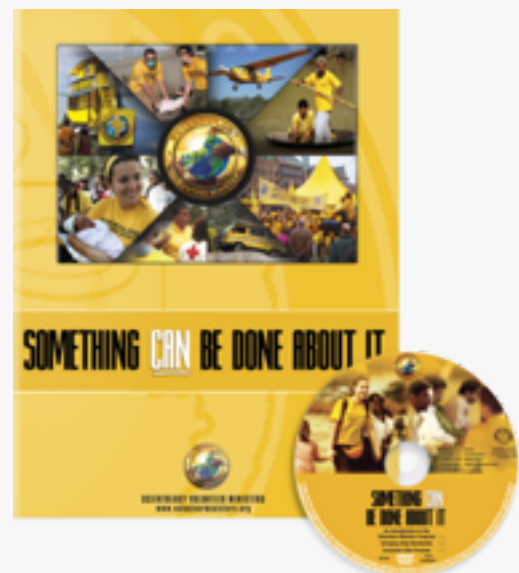
Church of Scientology Volunteer Ministers “Answers to Drugs” course offered free online