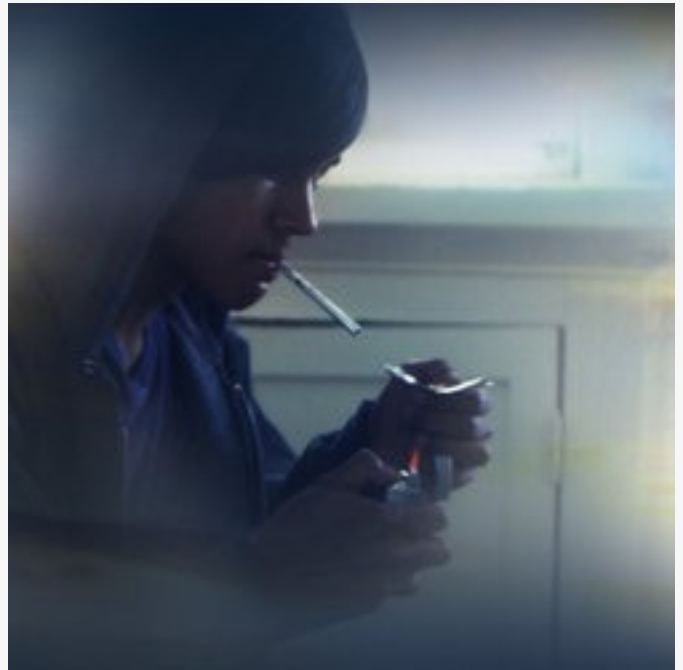
Drug overdose statistics have spiked throughout the U.S. during the COVID-19 months

strongly. No sector of life is untouched by this drug epidemic.”