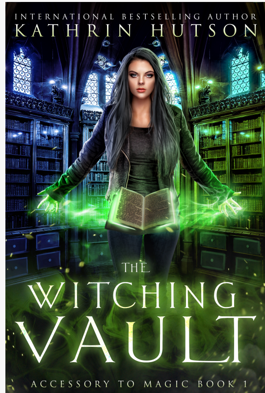
The Witching Vault

After her release from magical prison, Jessica Northwood can't hold a job to save her life. So when an apprenticeship opens up at a spellbound bank, no questions asked, she can't exactly say no... But she definitely should have. For centuries, the bank's owners have stood between the Gateway in the upstairs hall and the occult syndicate who want it for themselves. As the current owner, the scryer witch is supposed to have that under control. But when the woman turns up dead, Jessica's employment contract now says she's the one tasked with this lethal responsibility. Jessica has no idea what she's doing...and the bank won't let her leave. As she deals with magical