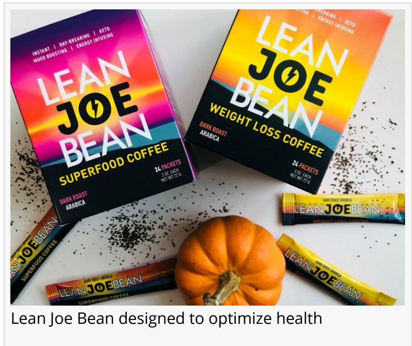
Lean Joe Bean designed to optimize health

The Lean Joe Bean coffees are friendly to keto and paleo diets and support the Intermittent Fasting lifestyle which has been said to aid detoxification, lead to decreased inflammation and aid anti-aging efforts.