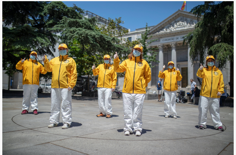
In May, Scientology Volunteer Ministers of Madrid handed out educational booklets as the country began to reopen.

Madrid has canceled many traditional holiday events to prevent the spread of the virus. And the Scientology Volunteer Ministers backed this up by visiting local shops to remind them of the importance of prevention protocols.