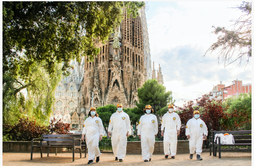
Volunteer Ministers of Barcelona also took part in the prevention campaign.

In May, 135 Volunteer Ministers from Scientology Churches and Missions across Spain