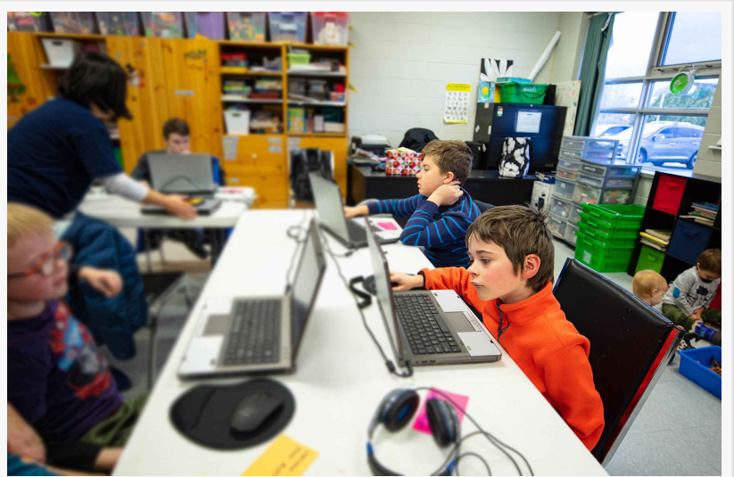
Students learning computer programming