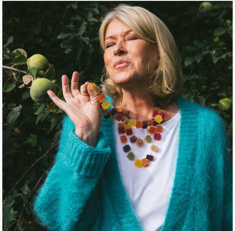
Martha Stewart's Gummy Necklace made from her CBD Wellness Gummy Sampler

"Holiday gift giving and receiving should be a joyous and fun occasion. In my experience, the gifts that are most appreciated are both luxurious and practical. Presented in a special gift box, my gummy sampler tastes like an elegant and delicious treat which delivers all the wellness benefits of CBD, making it the perfect way to indulge your loved ones, or yourself, without spending a fortune. With this special gummy sampler gift box, I was inspired by flavors from my garden," said Martha Stewart. She added, "Our celebrations may look a little different this year, but that doesn't make the season any less special. A thoughtful, useful gift like our CBD collection is easy to shop for online without leaving home."