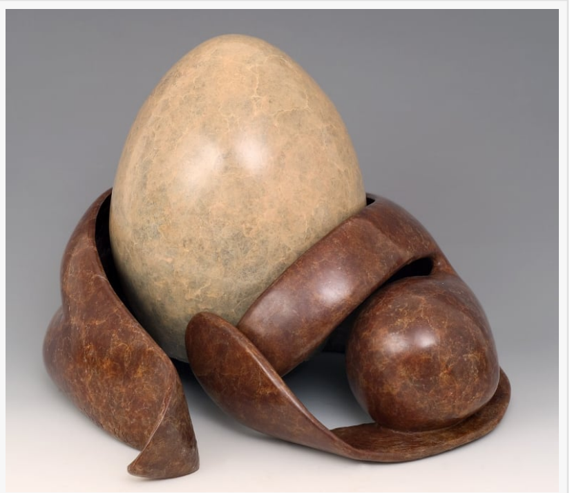
Fertility, Bronze Sculpture by Daniela Ament

This press release can be viewed online at: https://www.einpresswire.com/article/532023070