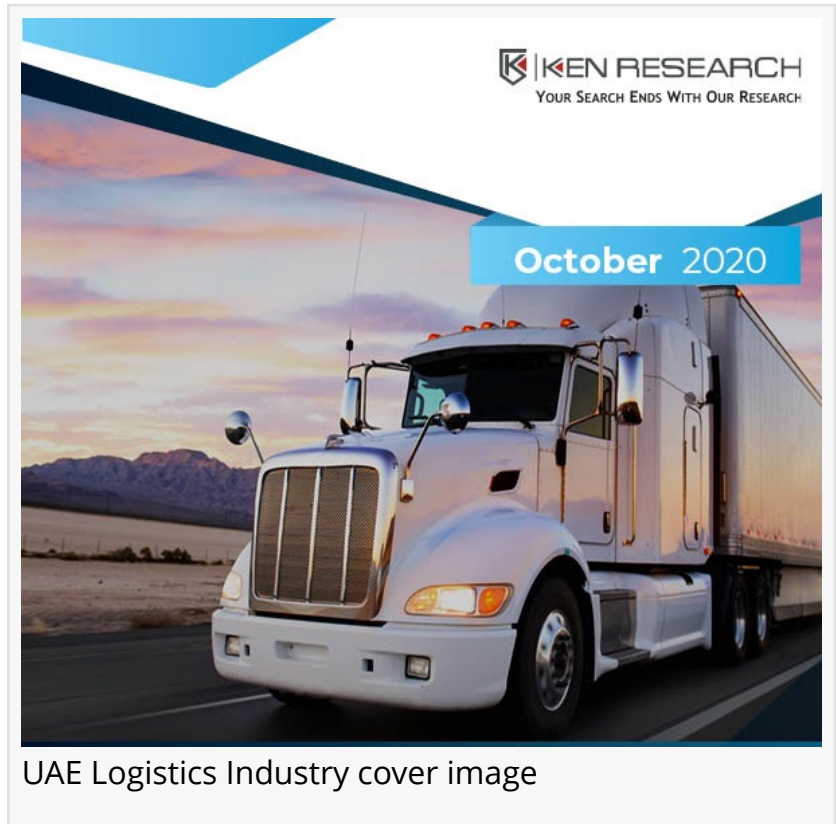
UAE Logistics Industry cover image

UNITED ARAB EMIRATES ( UAE ), December 4, 2020 /EINPresswire.com/ -- Etihad Cargo has outlined its plans to focus on COVID-19 focused services, setting up a dedicated COVID-19 distribution team in anticipation of a vaccine for the virus. Its new specialized pharma and healthcare product PharmaLife, will focus on key gateways including Abu Dhabi, Barcelona, Chicago, Paris, Dubai, Frankfurt, Hyderabad, London, Milan, Melbourne, Mumbai, Shanghai, Singapore, and Sydney.