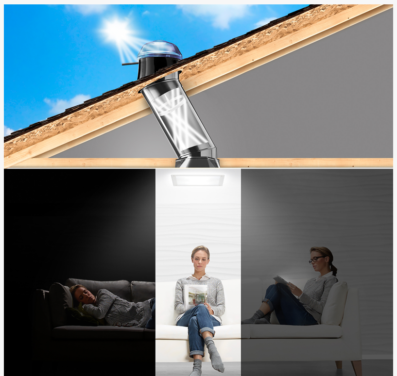
The Solatube Solar-Powered Daylight Dimmer wins Gold

Judges from a broad spectrum of industry voices from around the world participated and their average scores determined the 2020 award winners. Winners will be celebrated and presented their awards during a virtual awards ceremony in December.