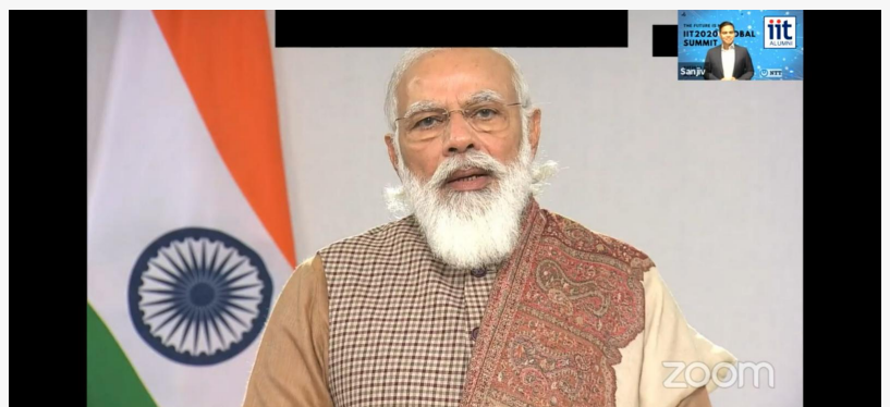
Prime Minister Narendra Modi provides opening address following warm welcome by IIT2020 Conference Chair Sanjiv Goyal.

/EINPresswire.com/ -- The world's largest virtual conference, 'IIT2020: Future Is Now' will be hosted online today through tomorrow, this December 4 and 5, 2020. While targeted to over 500,000 global alumni of 23 IITs across India, the free virtual mega conference is, for the first time ever, Open to All. The free conference is open for global registration to both IITians and non-IITians alike.