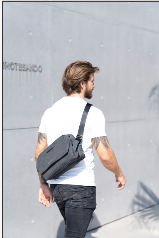
Cleanie Sling Bag Kickstarter Launch Redefines Sanitized Portability