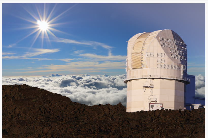
NSF's Inouye Solar Telescope sits near the summit of Haleakalā in Maui, Hawai'i. It is expected to begin operations in 2021.