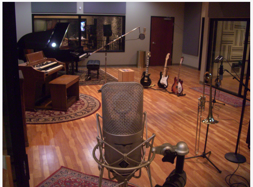
Sacramento, California's premier recording studio.