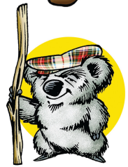
MR. KOALA A Wise Koala