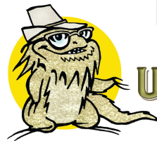
UNCLE HERMAN Chomper's Uncle who lives in Australia