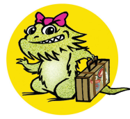
CHOMPER A Bearded Dragon from Colorado