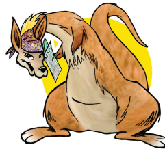
BanROO A Mischevious Kangaroo