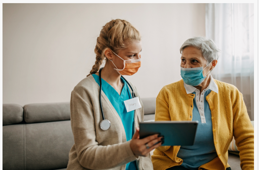
ShareSmart safeguards patient data and the health and safety of providers and patients.

ShareSmart is one of a limited number of options for authorized virtual health communication