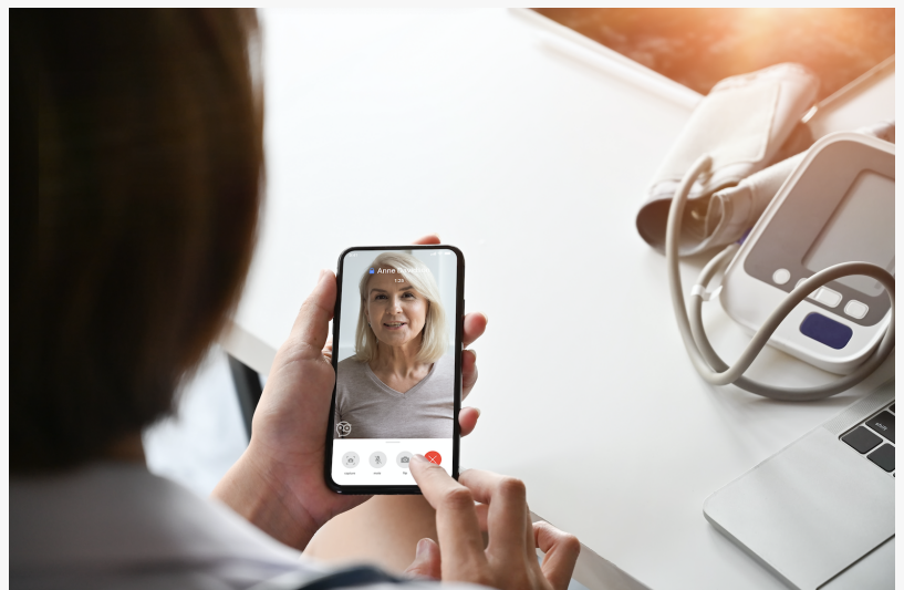
Secure video consultation through the mobile ShareSmart application for iOS.