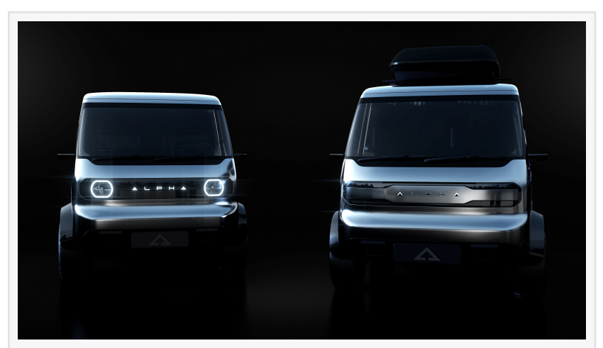
Alpha Motor Corporation © 2020. All Rights Reserved.

dollar EV market with a unique mobility innovation.