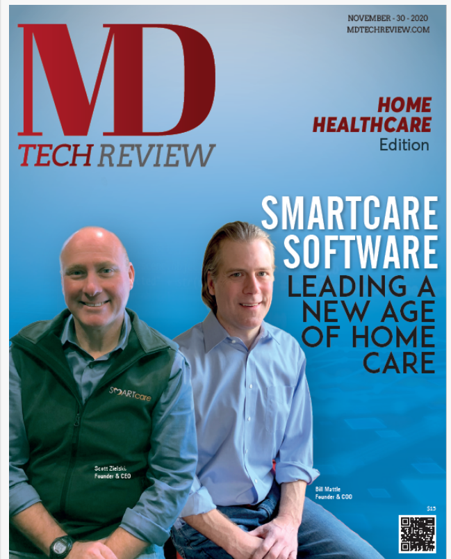
MD Tech Review November 2020 SMARTcare Software Cover Story