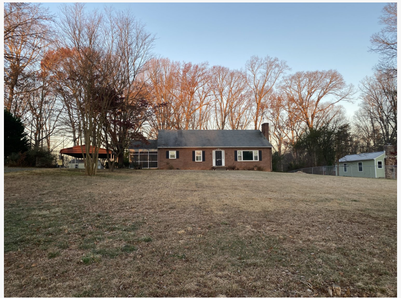
3532 Prichett Lane, Charlottesville, VA 22911