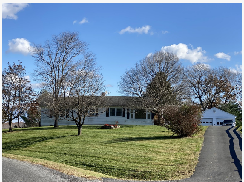
2329 Tanners Rd., Radiant, VA 22732