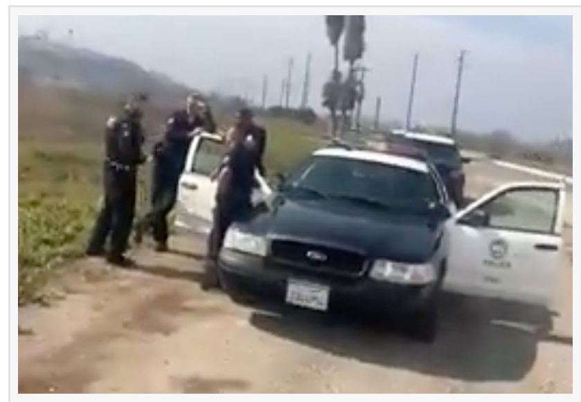
Several squad cars converge on an environmentalist documenting activity at Ballona Wetlands Ecological Reserve.

Bulldozing proponents paint the wetlands as rundown and dying. Actually, they are teeming with wildlife.