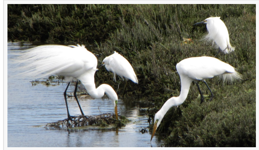
Egrets enjoying life at Ballona Wetlands, unaware there is a plan to destroy their home.

The Gentle Restoration Would Enhance Existing Trails