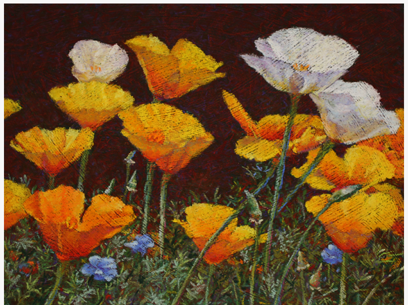
NC Art & The Bloom – Painting by Patricia Savage, Chapel Hill, North Carolina

Patricia Savage, a renowned botanical illustrator from Chapel Hill, will present the workshop entitled “The Language of Flowers.” Savage teaches botanical art and illustration at the UNC Botanical Gardens. She has also taught at the NC Museum of Natural Science and the NC Museum of Art. The workshop will explore the evolution of a single species over time and include painting petals using the dry brush watercolor technique.