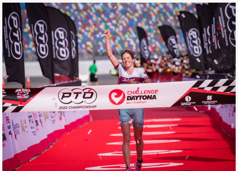
Paula Findlay Winning The PTO 2020 Championship

The PTO 2020 Championship at CHALLENGEDAYTONA® was the finalé of a three-day triathlon