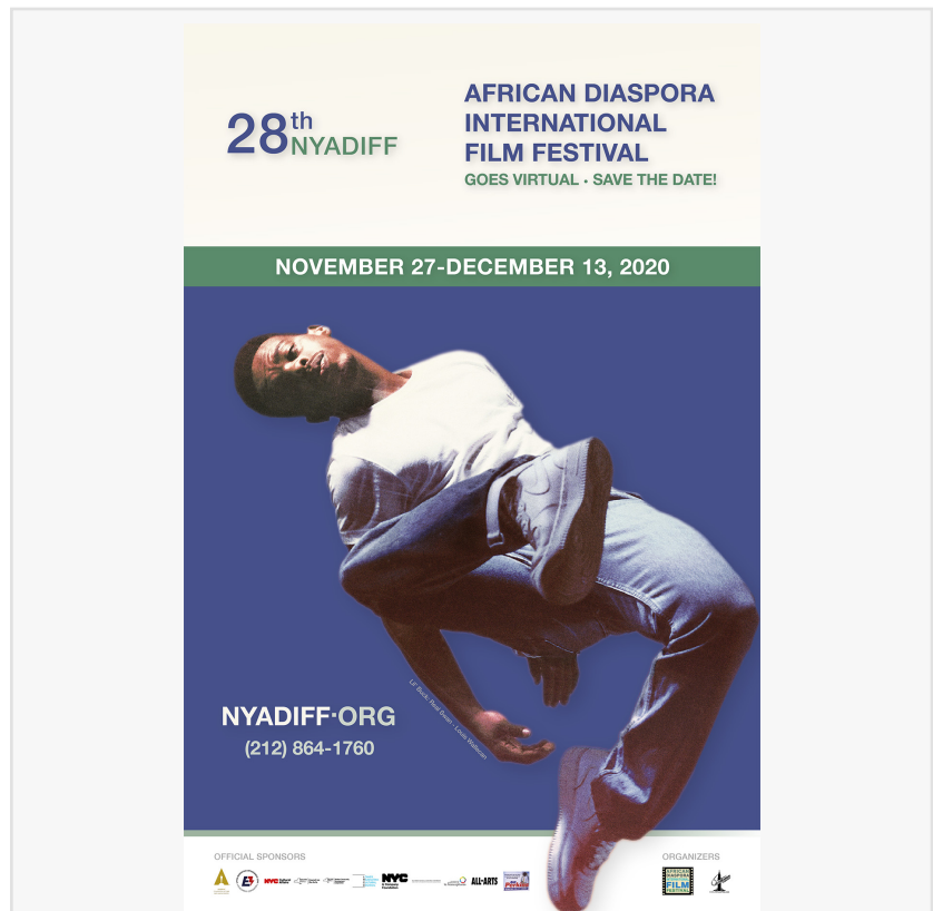
ADIFF 2020 Cover

ADIFF attracts a wide cross-section of cinephiles and audiences of African-American, Caribbean, African, Latino and European ethnic backgrounds who share a common interest for thought provoking, well crafted, intelligent and entertaining stories about the human experience of people of color, ADIFF is now a national and international event with festivals held in New York City, Chicago, Washington DC, and Paris, France.