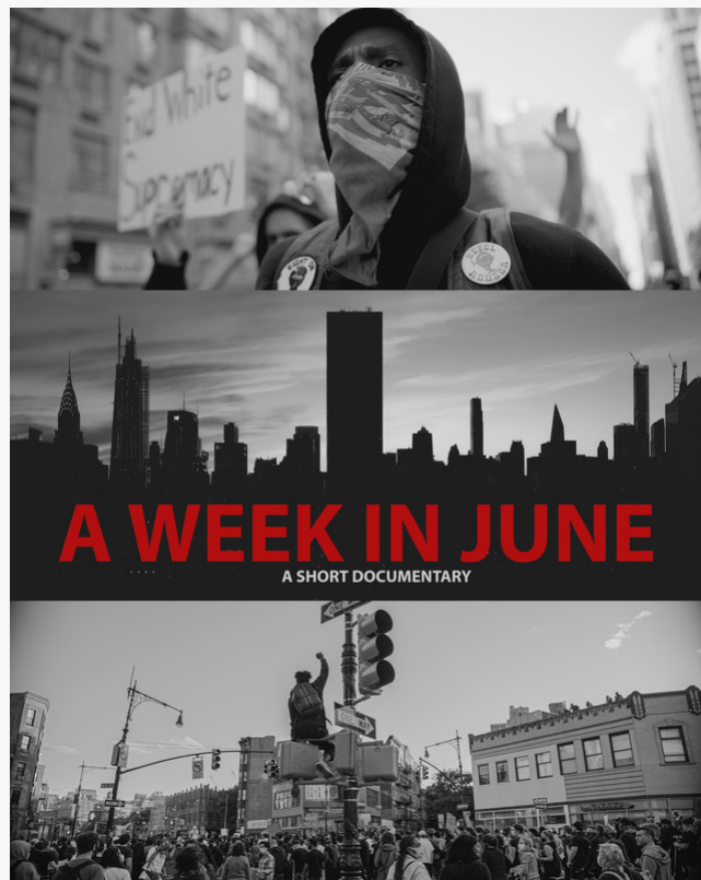
A Week in June Winner Best Documentary 2020