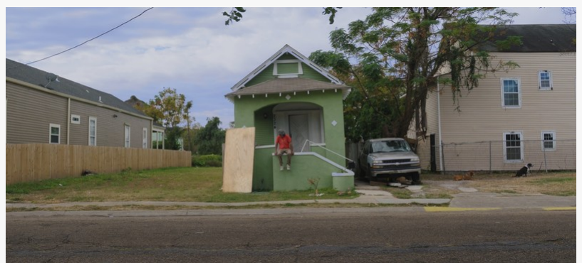
Winner Best Score

Congratulations to the winner of the 2020 NYC Short Documentary Film Festival!