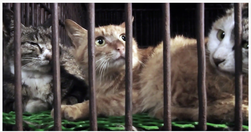
Cats and dogs suffer to become food in China, dying brutal deaths.