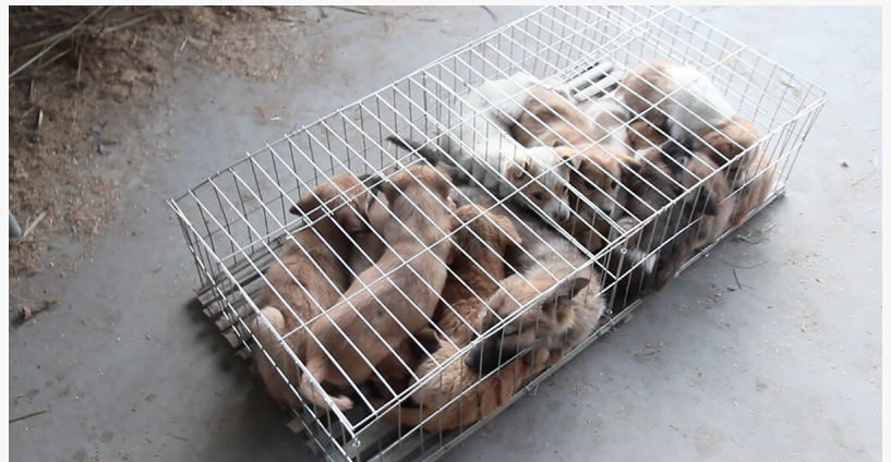
Most dogs and cats killed for food in China are stolen from loving homes.