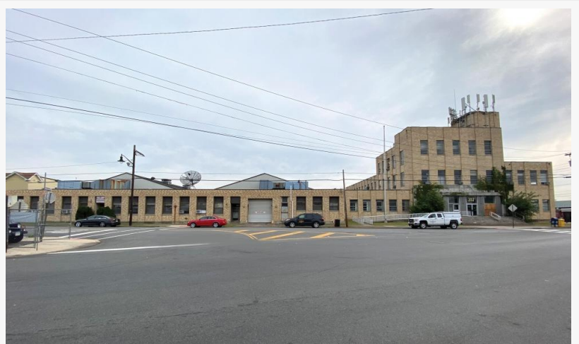
Former Admin Bldg Front

PATERSON, NJ, USA, December 11, 2020 /EINPresswire.com/ -- Max Spann Real Estate & Auction Co is pleased to announce the successful Auction of the former Passaic County Administration Building located at 305-319 Pennsylvania Avenue in Paterson, New Jersey. The high bid of $5,510,000 for the 81,386+/- sq. ft. building was approved by Passaic County at their December 8th meeting and will close in approximately 90 days.