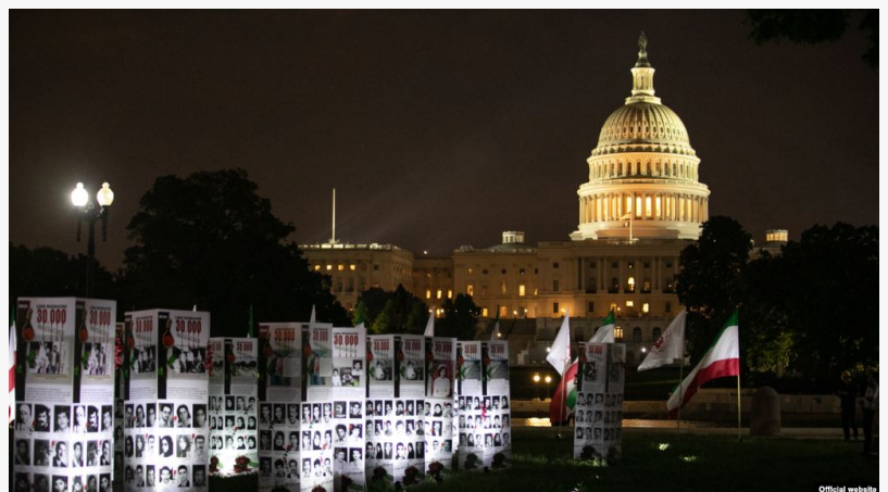
Photo exhibition of victims of Iran regime's crimes against humanity, September 2020, US Capitol, Washington, DC.