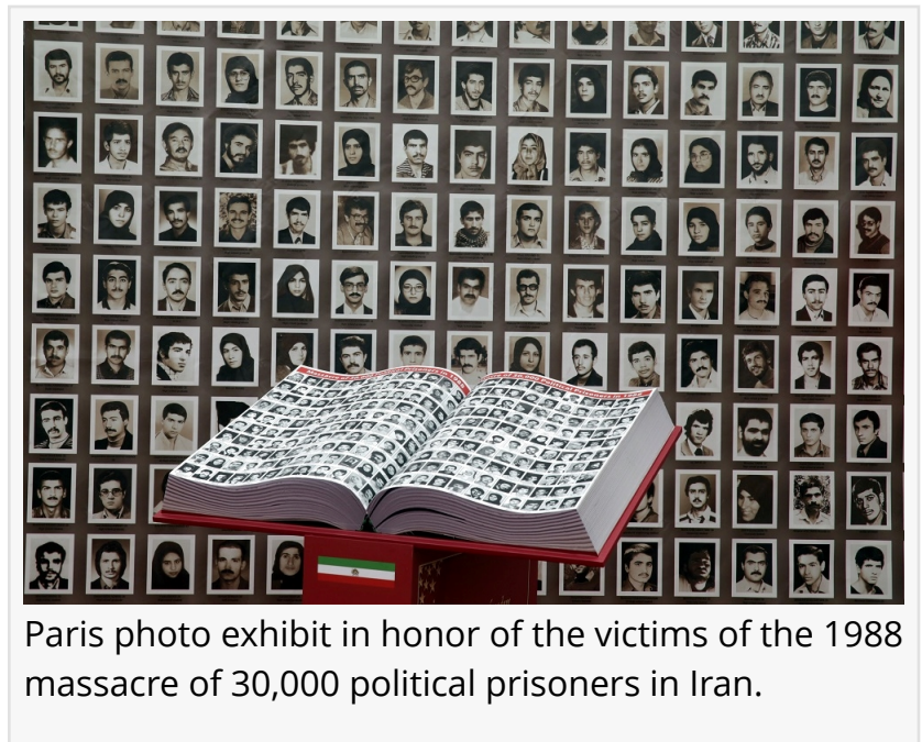
Paris photo exhibit in honor of the victims of the 1988 massacre of 30,000 political prisoners in Iran.