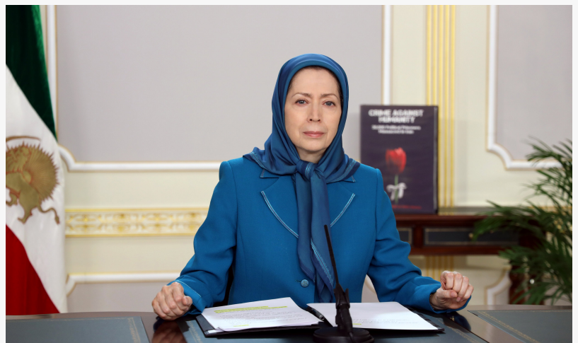
NCRI President-elect Maryam Rajavi speaks to Iranian people on significance of UN experts' communication on the 1988 massacre of political prisoners in Iran.

She added that the current rulers of Iran, “Particularly [the regime’s Supreme Leader] Ali Khamenei, [the regime’s President] Hassan Rouhani, [the regime’s Judiciary