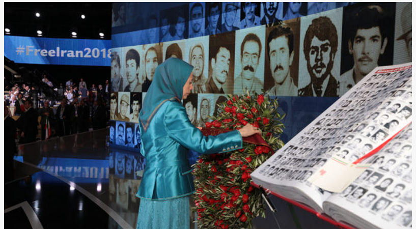
NCRI President-elect Maryam Rajavi honors victims of the 1988 massacre of the political prisoners in Iran.