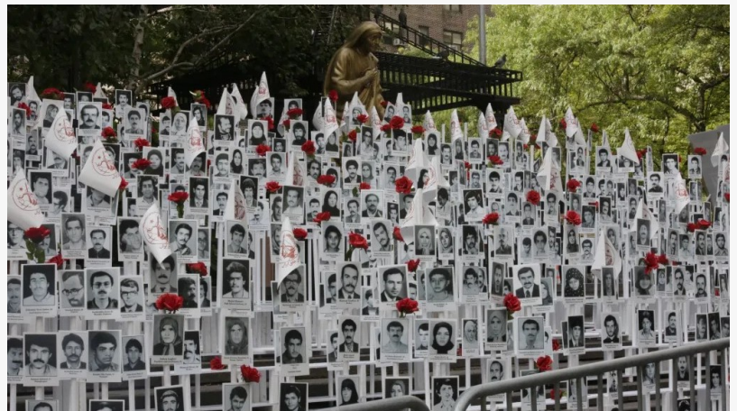
UN Experts' Report on Iran 1988 Massacre Necessitates Independent Investigation, Accountability

EINPresswire.com/ -- December 10 marks the internationally recognized Human Rights Day, a harbinger of an end to tyranny and oppression and a day to pay tribute to all defenders of human rights and dignity. This year, it also marks a new awakening of the world conscience to the past and present crimes against humanity committed by the religious dictatorship ruling Iran, most notably the 1988 massacre of thousands of political prisoners and the 2019 massacre of over 1,500 pro-democracy protesters.