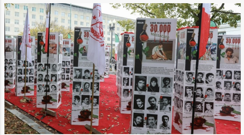
Photo exhibition across the US Department of State, displaying over 40 yrs of human rights violations in Iran & the 1988 massacre, October 2020.

All Iranian officials "who commit human rights violations or abuses should be held accountable. The United States calls on the international community to conduct independent investigations