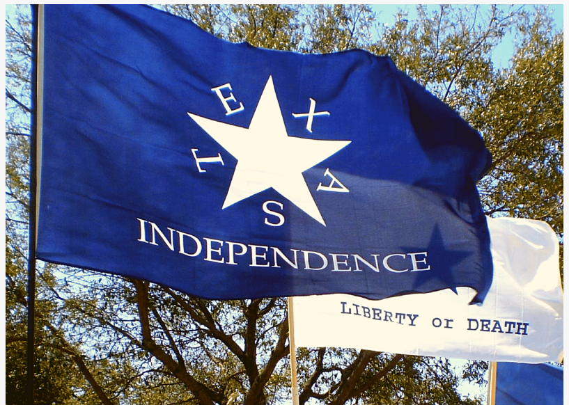
The flag of Texas Independence