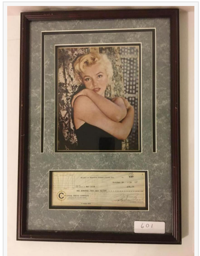
Typed check from 1959 signed by Marilyn Monroe, boasting a strong signature, matted and framed along with a photo of the late actress and with a certificate of authenticity ($3,120).