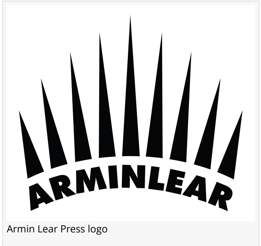
Armin Lear Press logo