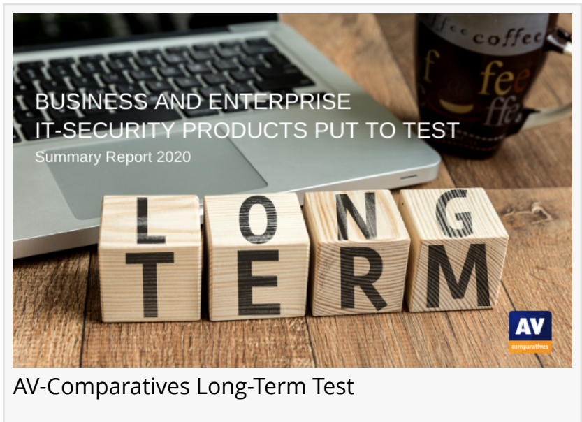
AV-Comparatives Long-Term Test

Peter Stelzhammer AV-Comparatives +43 720 115542 media@av-comparatives.org Visit us on social media: Facebook Twitter LinkedIn