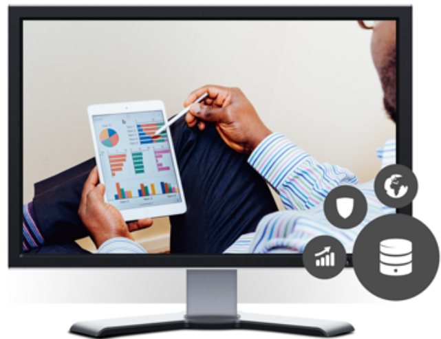
AV-Comparatives Long-Term Test Enterprise and Business IT Security Vendors 2020

Overall, AV-Comparatives' December 2020 Business Report provides IT managers and CISOs with a detailed picture of the strengths and weaknesses of the tested products, allowing them to make informed decisions on which ones might be appropriate for their specific needs. Like all AV-Comparatives' public test reports, the Enterprise and Business Endpoint Security Report is available to everyone for free: