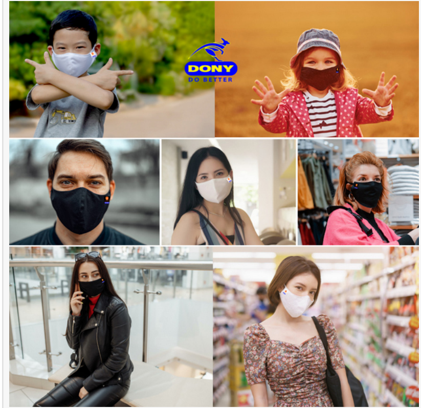
Fashionable & stylish cloth face mask according to the current industry trends and user demands.

□□evel 2 or 3 masks can filter 98% and up to 99% bacteria and other harmful agents.