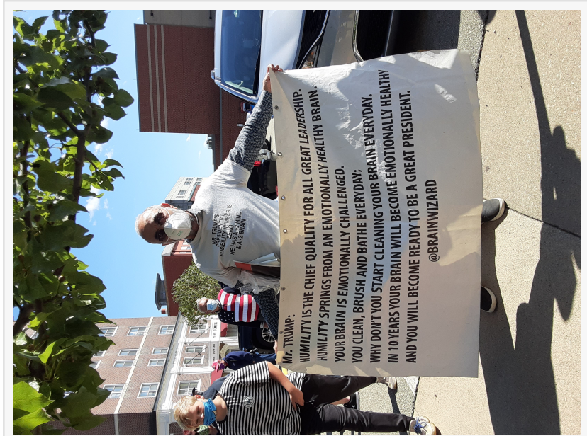
This is the truth about Trump and his senators.

I am an activist for emotional health. I am in touch with the new Biden-Harris administration. I have been assured that the new White House is open to innovation, and they will do what no president has ever done. They will focus full-throttle on emotional health. They will make America into an emotional health superpower. They will help create health, happiness, and prosperity for all.