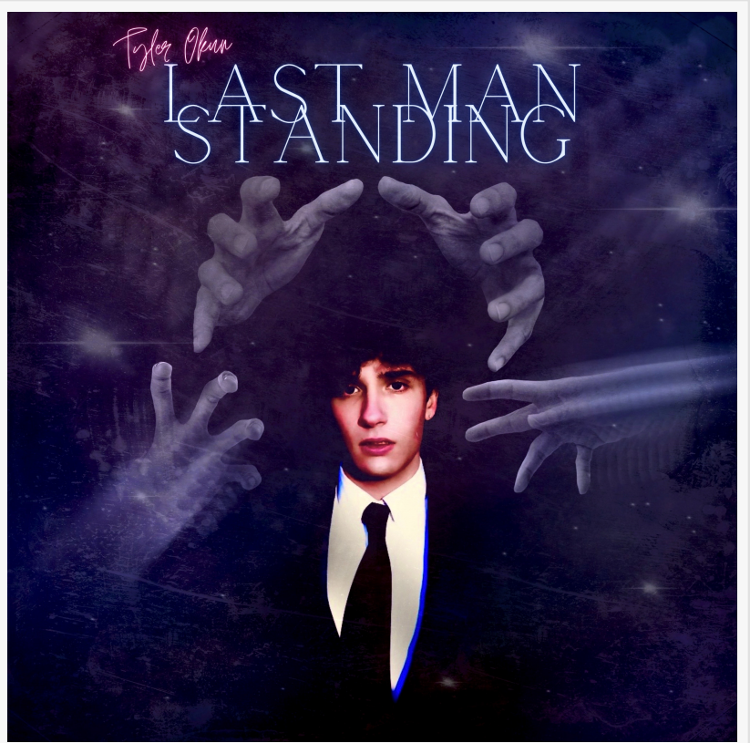
Last Man Standing Album cover