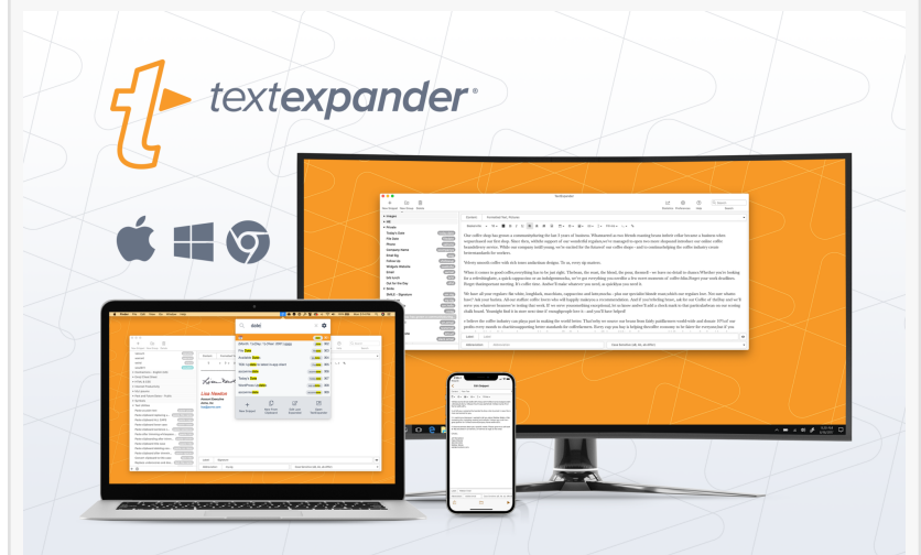
TextExpander is cross-platform