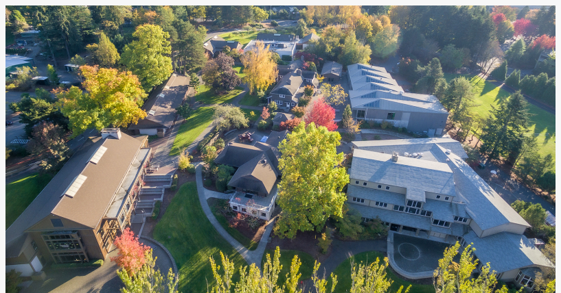
The contact tracing app was designed specifically for employees on the Catlin Gabel School campus.

EINPresswire.com/ -- An innovative contact tracing app designed by two high school students, known as cTrace, was launched this fall, replacing a more cumbersome Google form at Catlin Gabel School in Portland, Oregon, to track individual movements across campus in response to the state's contract tracing measures enacted to reduce the spread of COVID-19.