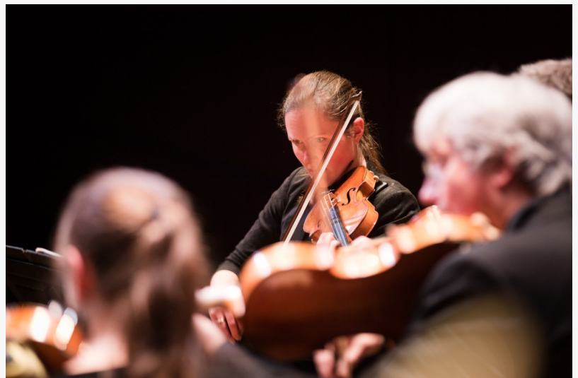
A section of the English Symphony Orchestra