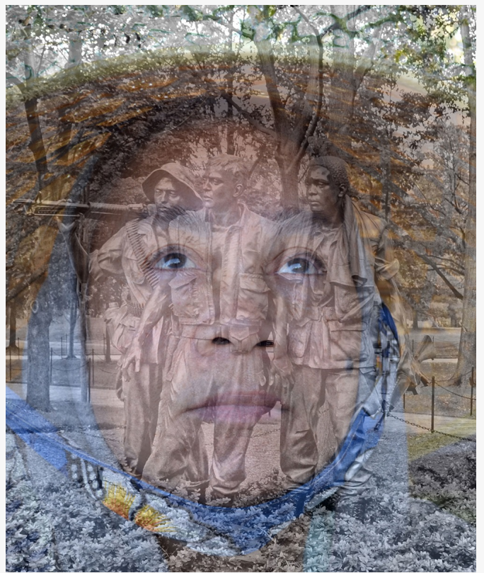
Remembering The Loss of American Soldiers